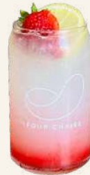
Strawberry Lemonade 6