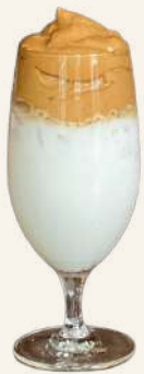
Volcano Coffee 7 Mocha Lava 8 Choco Milk 7 Selection : Whole milk, Oatly +1, Almond +1