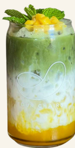
Matcha Latte 7 Strawberry Matcha 7 Mango Matcha 7 Selection : Whole milk, Oatly +1, Almond +1