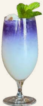
Butterfly Lychee 7 Mango Tango 7 Piña Coco 7 Add Soju shot +4