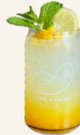
Mango Lemonade 6