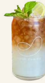
Arnold Palmer 6