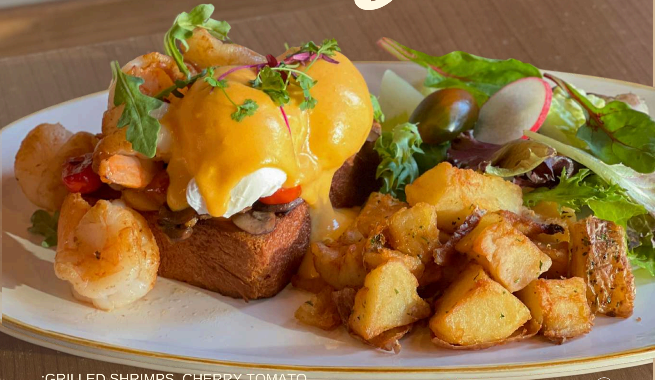
:GRILLED SHRIMPS, CHERRY TOMATO, MUSHROOM WITH TOM YUM HOLLANDAISE SERVED ON BRIOCHE TOAST