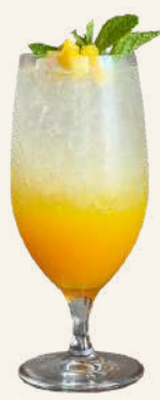
Mango Tango 7