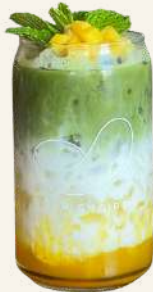
Mango Matcha 7

Selection : Whole milk, Oatly +1, Almond +1