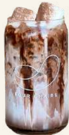
Choco Milk 7