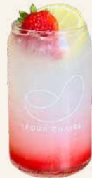
Strawberry Lemonade 6