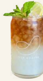
Arnold Palmer 6