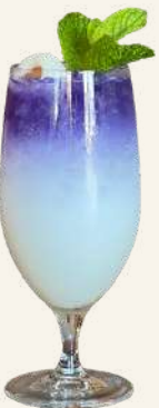
Butterfly Lychee 7

Selection : Whole milk, Oatly +1, Almond +1