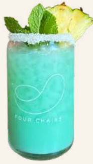
Piña Coco 7