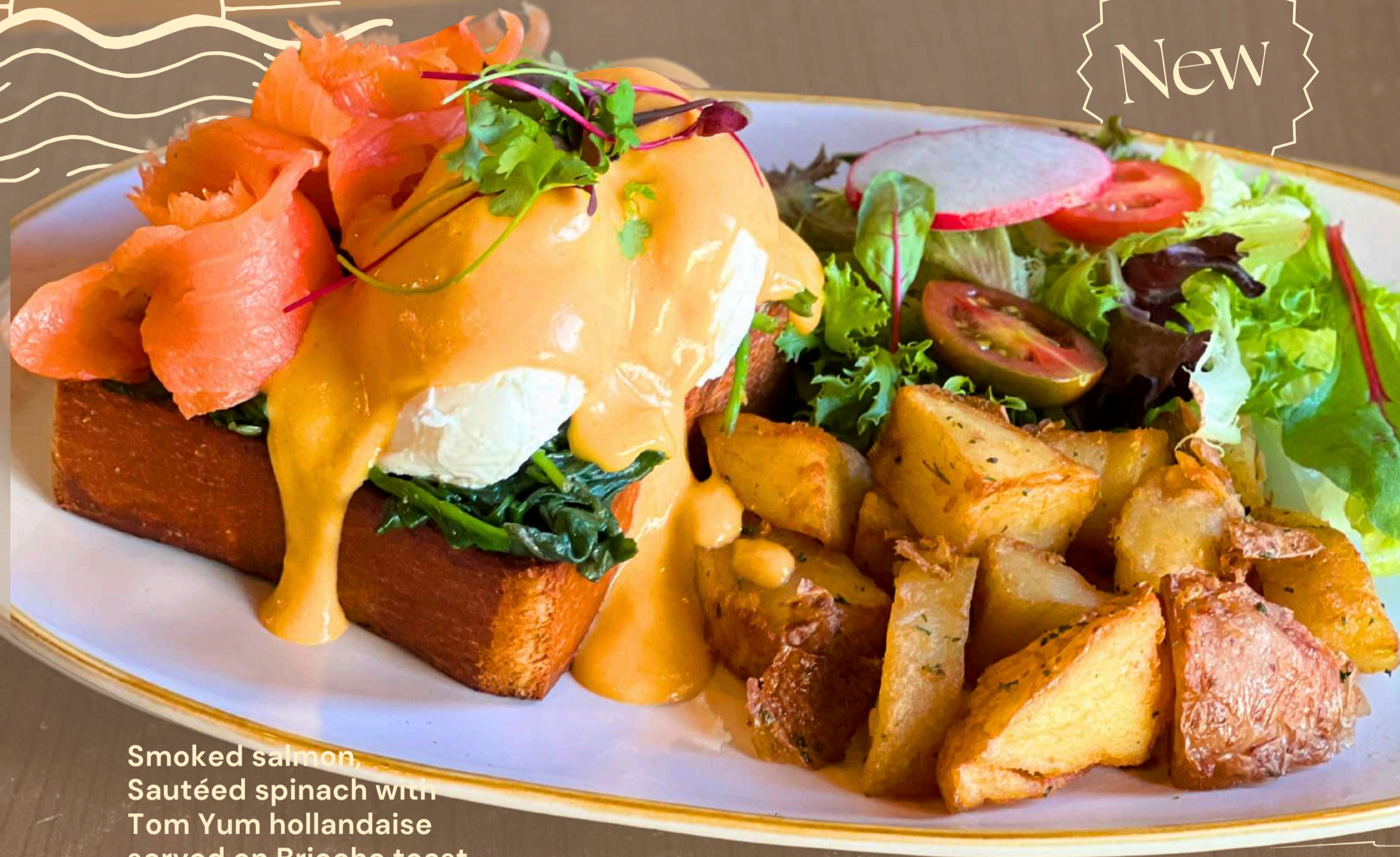
Smoked salmon, Sautéed spinach with Tom Yum hollandaise served on Brioche toast @Fourchairs.sf