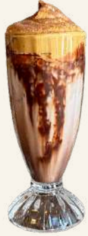
Mocha Lava 8