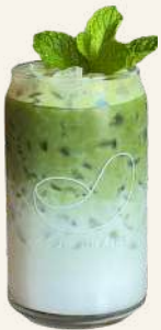
Matcha Latte 7