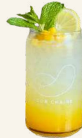
Mango Lemonade 6