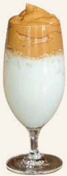
Volcano Coffee 7