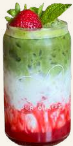
Strawberry Matcha 7